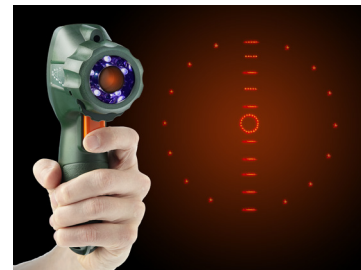
Coaxial laser shows you the area being measured to maintain accurate measurement distance